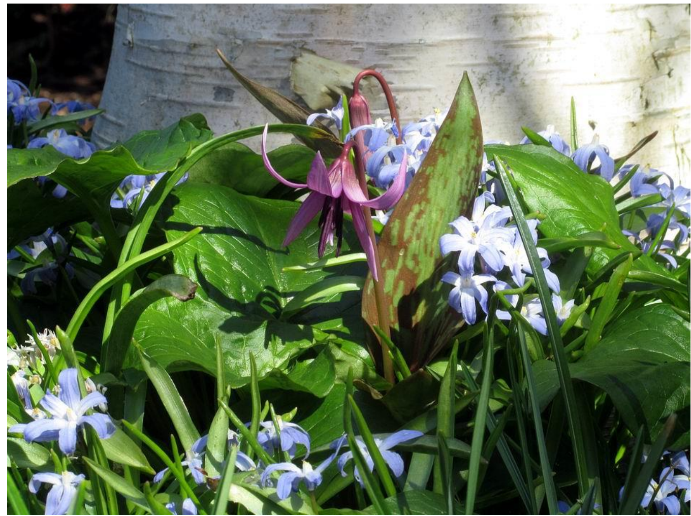
Further along the same bed Erythronium japonicum is one of the plants growing right at the base of the birch tree.