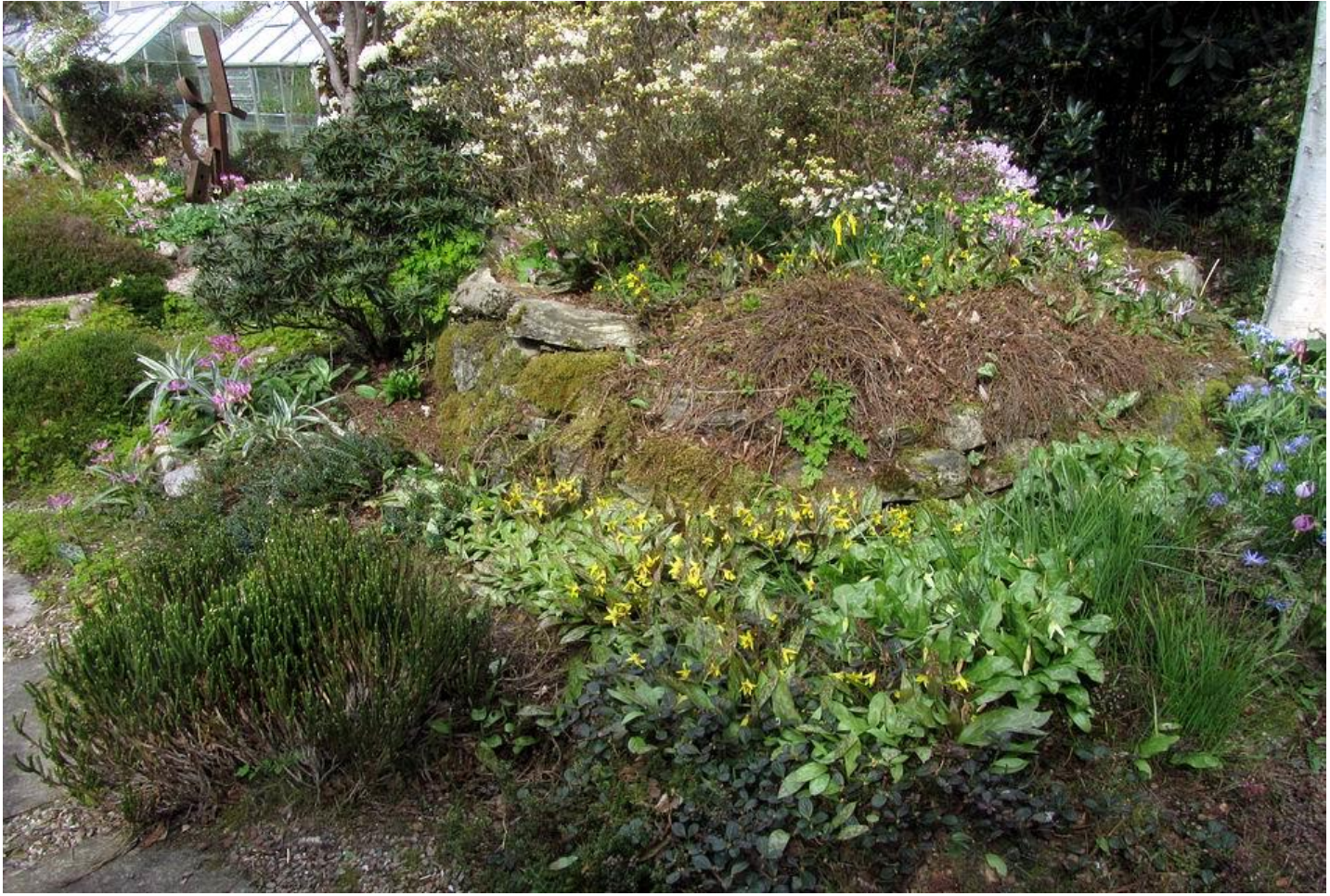
This is the reverse view of the central raised bed shown in the previous picture -I would like to draw your eye down to the planting of Erythronium americanum in the foreground. This is the stoloniferous form that can be reluctant to flower - over many years it has spread out covering well over a square metre.

Despite the weather the plants continue to grow - in the foreground the bright green foliage of Corydalis 'Craigton Blue' looks so fresh even though it has been out since the autumn. I can see flower spikes appearing on some of the plants I lifted and moved into another bed – this plant does best if you lift and split it every few years; replanting it into some fresh ground enriched with some garden compost gives it a real boost.