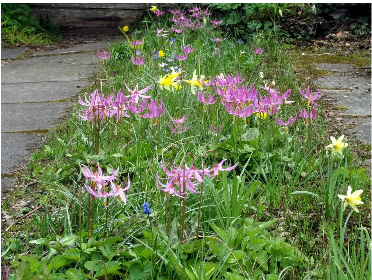
For many years I have also been scattering seeds of Erythronium revolutum in the front drive where they have now become a nicely established and self-seeding colony.