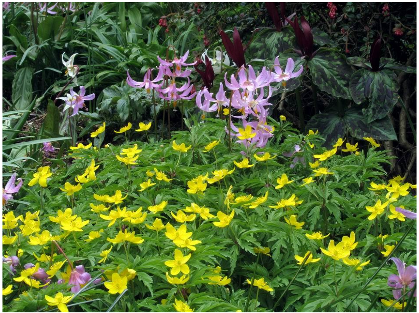
Trillium and Erythronium grow in harmony with a carpet of Anemone ranunculoides.