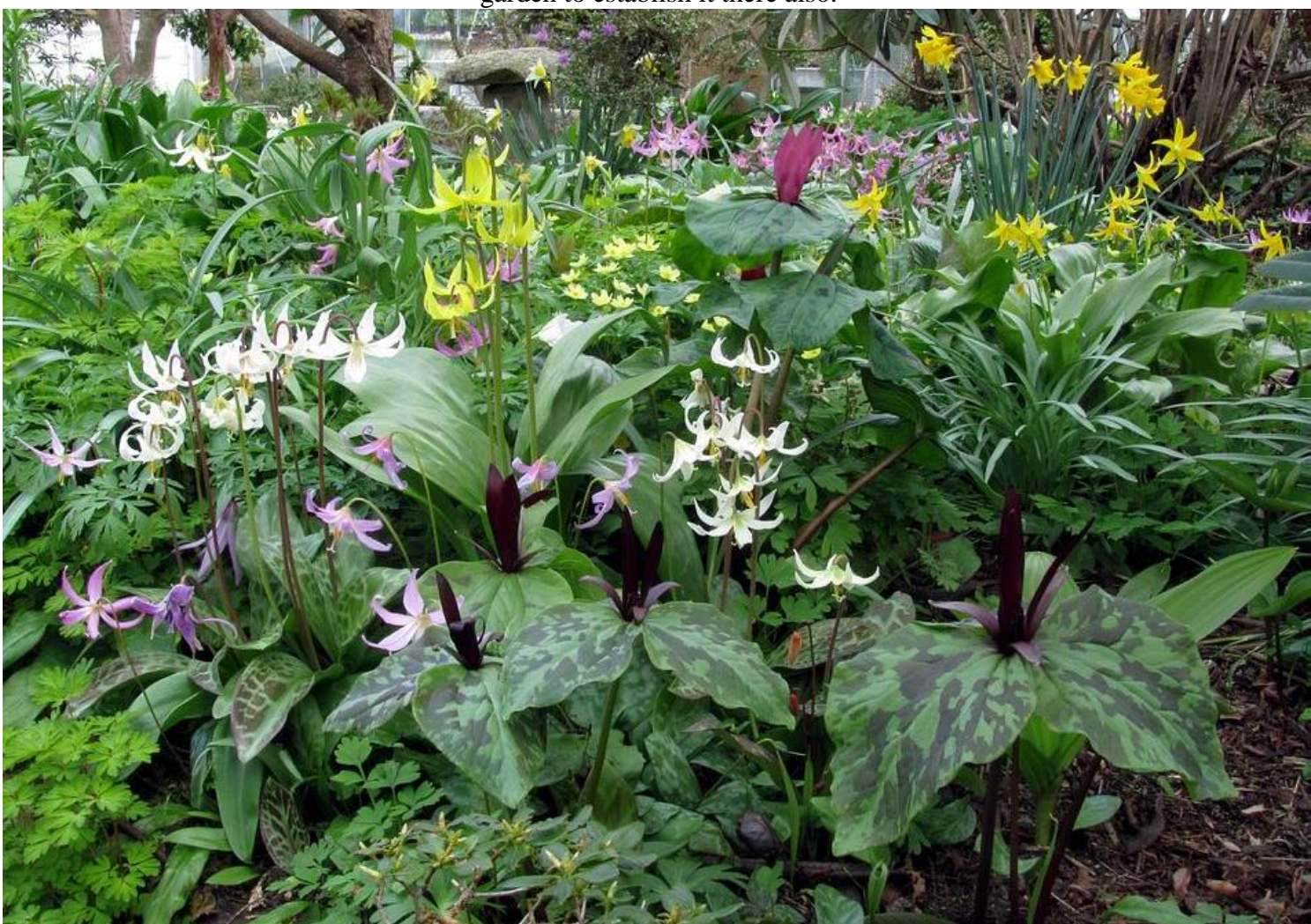
In the back garden, here is a group of sessile Trilliums which I find very difficult to name: they could be Trillium kurubayashii or Trillium chloropetalum I find it increasing difficult to key out these two species in our garden. As these plants are mostly raised from garden seed I suspect what we have is a nice range of garden hybrids.