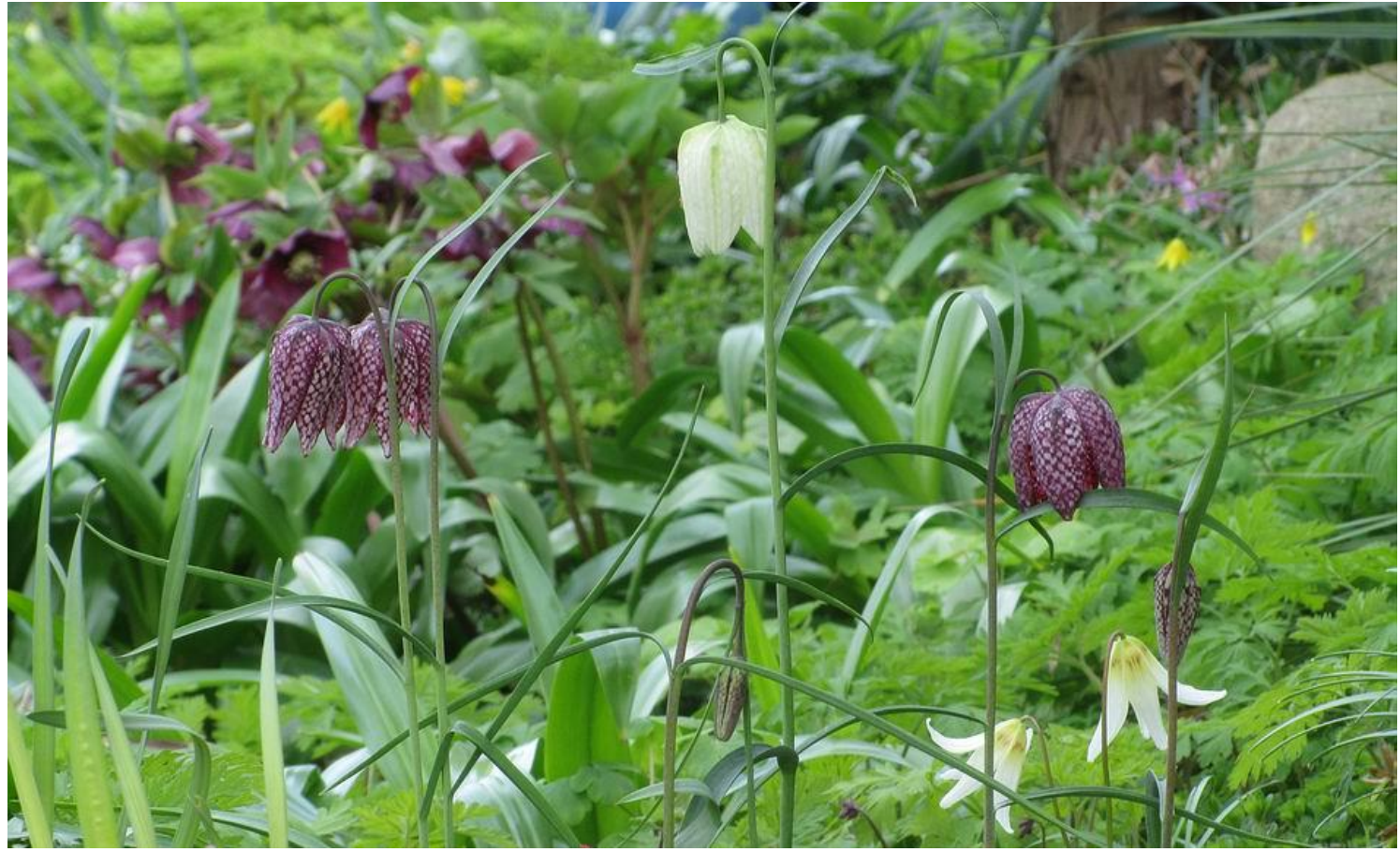
Fritillaria meleagris seeds around the front drive and we are also scattering the seeds in the open parts of the front garden to establish it there also.