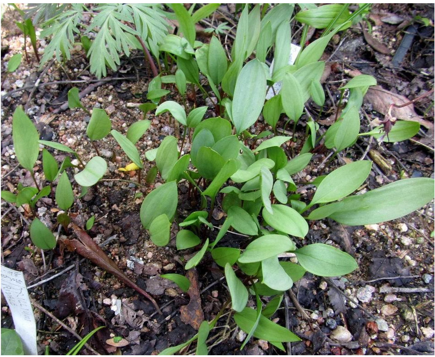
Erythronium sibiricum seedlings, year three.

Not knowing the latest correct name of these plants will not deter me from growing them as they are great additions to our garden. I have been sowing most of our own seed ever since we first flowered this plant and here is a pot of last years seed, which was sown as soon as it was ripe, germinating. Below you will see a mesh plunge basket of two and tree year old seedlings – mixed ages because even when sown fresh there will be some seeds that do not germinate until the second spring. This is the form with plain green leaves that I thought had been called Erythronium krylovii until I discovered the published paper describes it as white flowered.