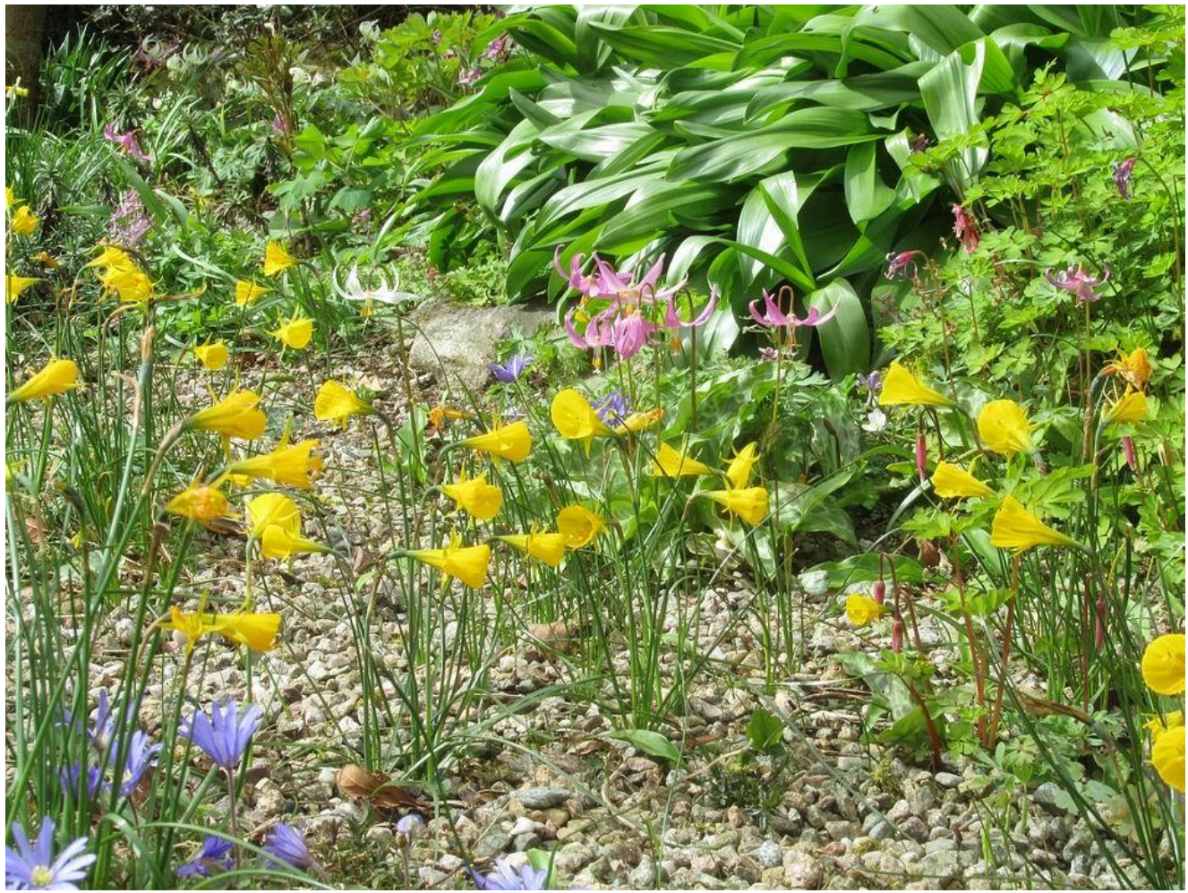
Narcissus bulbocodium and Erythronium have self-seeded into the gravel areas of the back garden, also there is Anemone blanda - peaking into the bottom left corner.