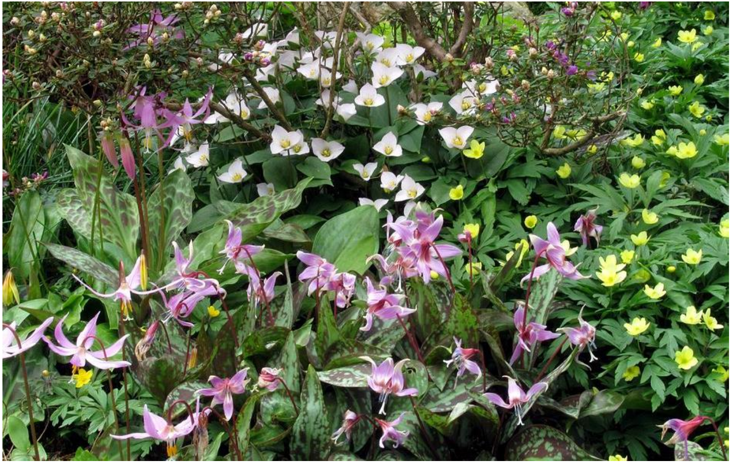
On the higher part of the bed Trillium rivale grows at the base of a dwarf Rhododendron surrounded by Anemone x lipsiensis , Erythronium revolutum just coming out as Erythronium dens-canis flowers are fading. Click to view <u>a Bulb Log Video Diary Supplement</u> looking around this central raised bed.