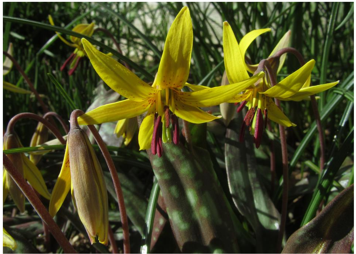
Erythronium americanum 'Craigton Flower'