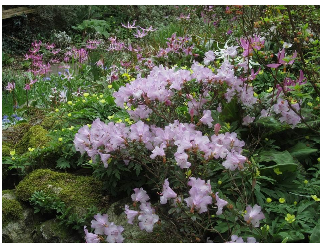
Rhododendron uniflorum var. imperator

Rhododendron 'Pintail' Rhododendrons of all sizes play an important role providing structure in our garden they also bring great colour.