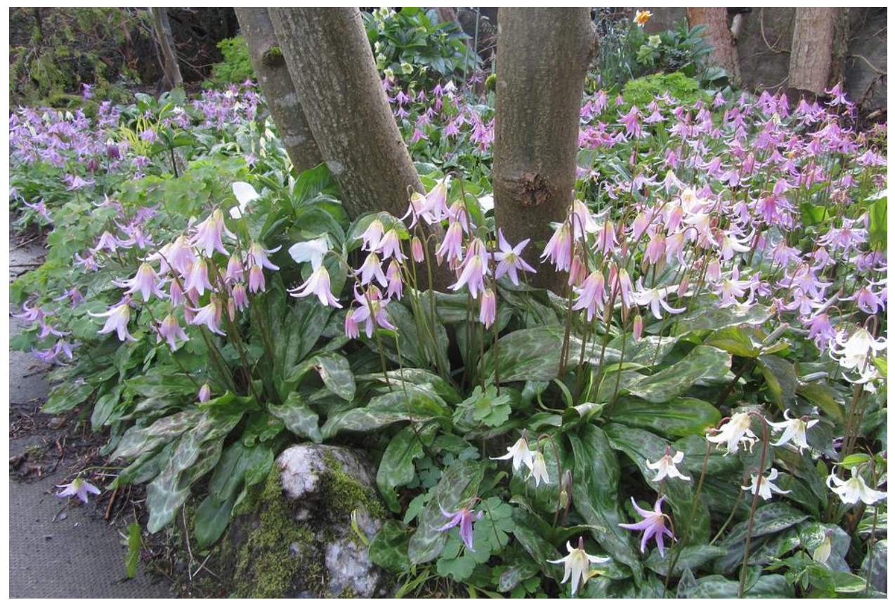
Below the Laburnum tree is where I discovered the first plant of Erythronium 'Craigton Cover Girl' I have left some of this original planting in position where it increases nicely.