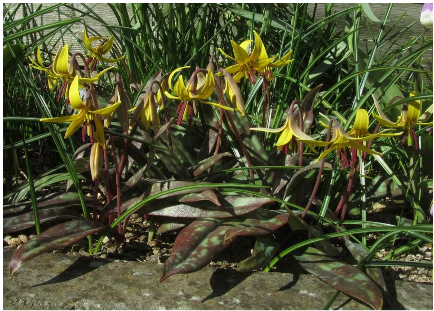
I selected Erythronium americanum 'Craigton Flower' as a free flowering form and here it has opened its flowers in the warmth of the sunshine.