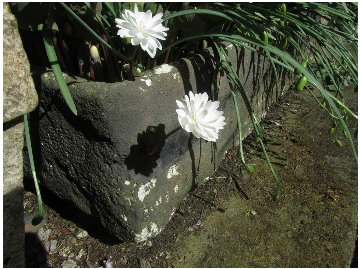
I showed this trough a few weeks ago, when the snowdrops were in full flower, when I pointed out the Sanguinaria shoot that had pierced trough the wall of the polystyrene trough – now it is in full flower.